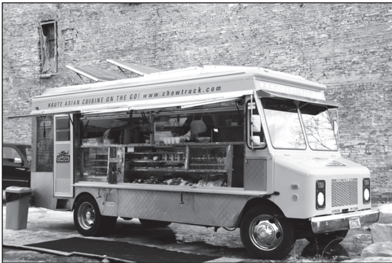
Chow premiered last week, catering to Outdoor Retailer attendees. It is expected to be on site at Trolley Square this week for Sundance.